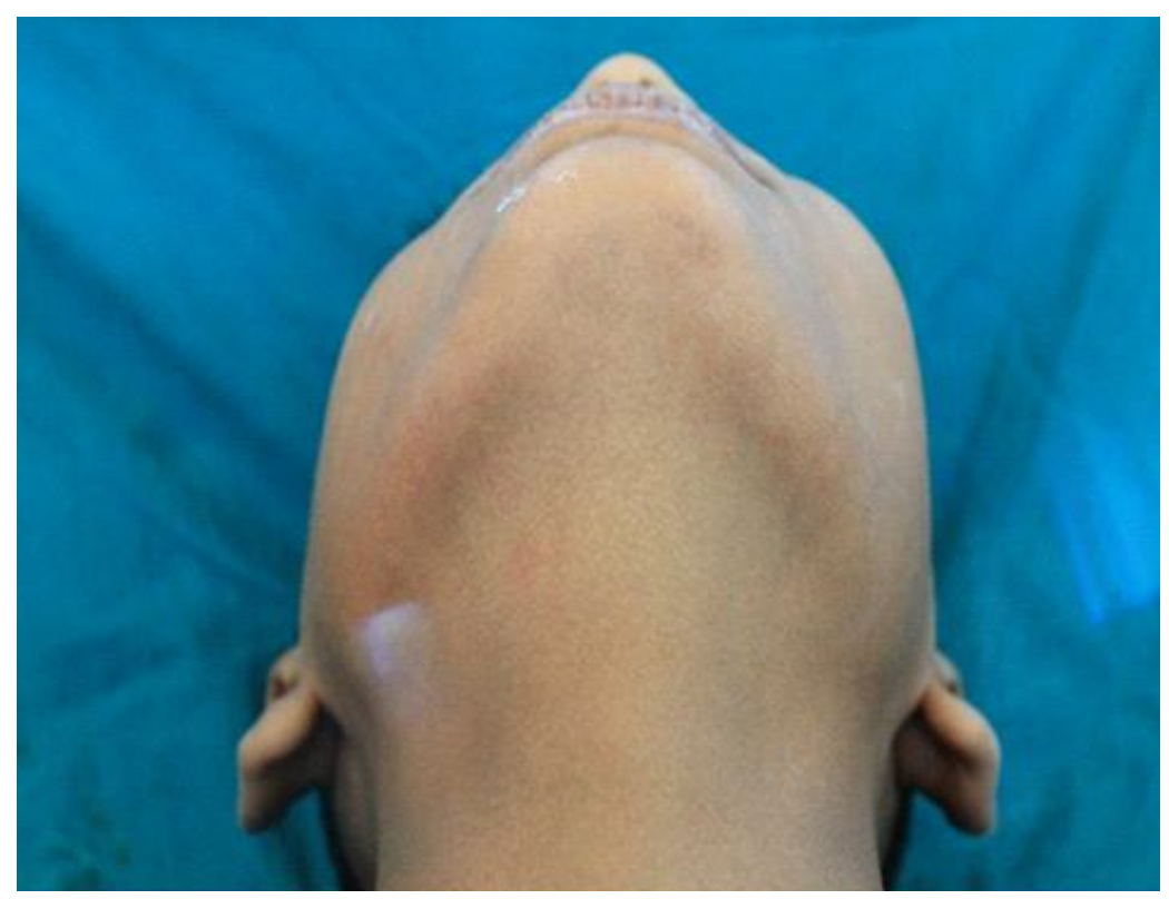
Fig 1: Diffuse Swelling present over the left mid face region extending from the infra orbital ridge up to the upper border of the lip superio inferiorly

ossifying fibroma. Radiographs were taken. loparreveals altered trabeculations giving it a ground glass appearance. This is a loss of trabeculations and loss of lamina dura (fig. 4). Opg (fig. 3) reveals full complement of upper and lower teeth with welldefined radio-opacity over the left maxillary sinus and the floor of the sinus is not evident with mild distal tipping of the roots of 26. PNS (fig. 5) reveals complete obliteration of the left side maxillary sinus with a homogeneous well defined radio opacity. There is deviation of the nasal septum towards the right side. CT (fig. 6) reveals obliteration of the maxillary sinus which has a ground glass appearance uniformly with HU of 678 of blending with the surrounding walls of the antrum and there was no post contrast enhancement of the peripheral rim differentiating it from ossifying fibroma. Patient was subject to biochemical investigation of alkaline phosphatase which was 266 IU/L. Skeletal survey was done to rule out any other bone involvement and rule out presence of any café au lait spots. With all this the final diagnosis was given as monostotic