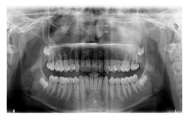
Fig 4: IOPAR revealing typical frosted glass appearance Laminadura is not seen Obliteration of PDL space Floor of the sinus is not seen

Fig 3: There is an evident homogenous radio opacity with ill defined borders which is extending medialy from the 23 to 28